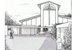
St Patrick's Catholic Church