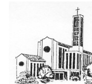
Waiapu Anglican Cathedral of St John the Evangelist