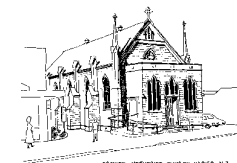
Trinity Methodist Church