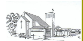
St Paul's Presbyterian Church